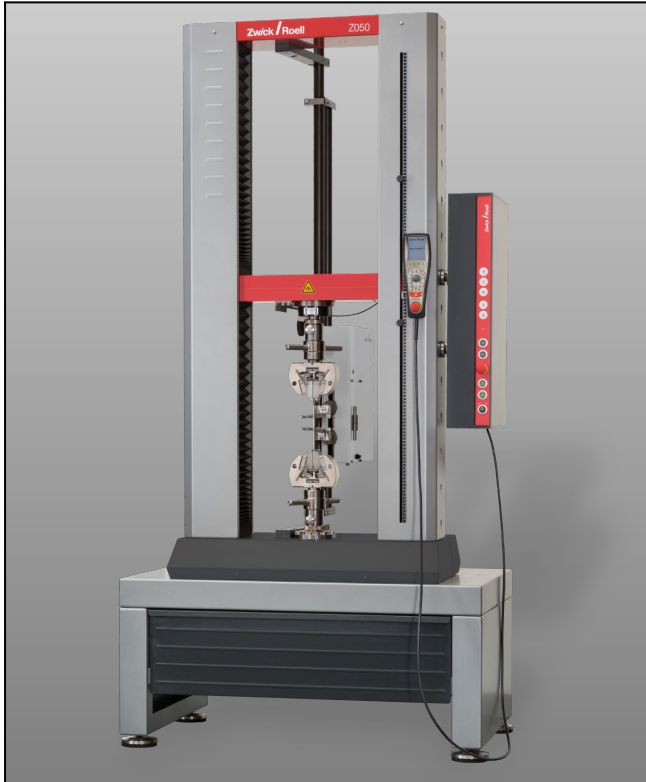
ProLine makroXtens HP